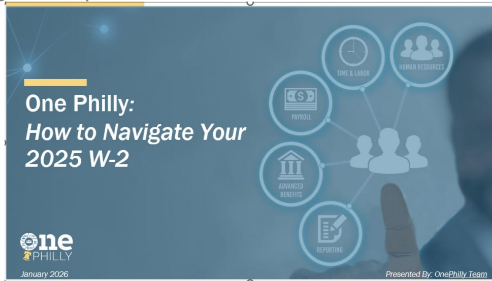
W-2 Navigation Guide

2. The following is an example of documentation from the W2 Info Links: