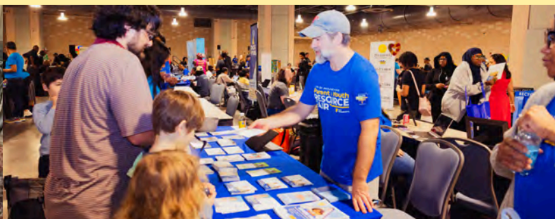
The Parent & Youth Resource Fair brought together families, dozens of City departments, and community providers to share free to low-cost programs and resources for children, teens, and families.