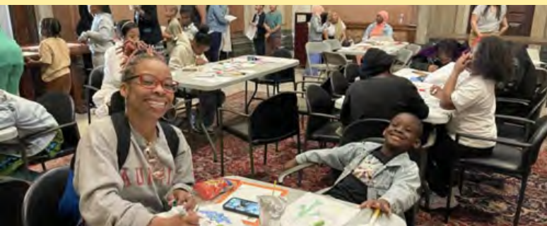
The Office of the Chief Administrative Officer hosted Bring Your Child to Work Day at City Hall, an opportunity for kids to enjoy demos, hands-on fun, and treats all while learning how City departments serve the public.

We Walk PHL is a free walking group that meets several times per week. All walks are led by a team of community volunteers. Launched as a pilot program in 2017 at 3 parks, this program has expanded to over 25 locations at parks and rec centers across Philadelphia. We Walk PHL is a partnership between Fairmount Park Conservancy, the Philadelphia Department of Public Health and Philadelphia Parks and Recreation. Learn more!