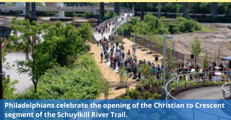
Philadelphians celebrate the opening of the Christian to Crescent segment of the Schuylkill River Trail.

We Walk PHL is a free walking group that meets several times per week. All walks are led by a team of community volunteers. Launched as a pilot program in 2017 at 3 parks, this program has expanded to over 25 locations at parks and rec centers across Philadelphia. We Walk PHL is a partnership between Fairmount Park Conservancy, the Philadelphia Department of Public Health and Philadelphia Parks and Recreation. Learn more!