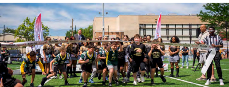
Philly Youth celebrate Murphy Recreation Center's grand reopening.