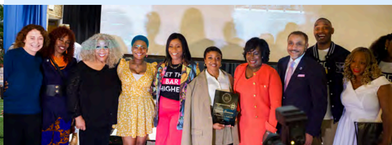
Quinta Brunson receives a key to the city.