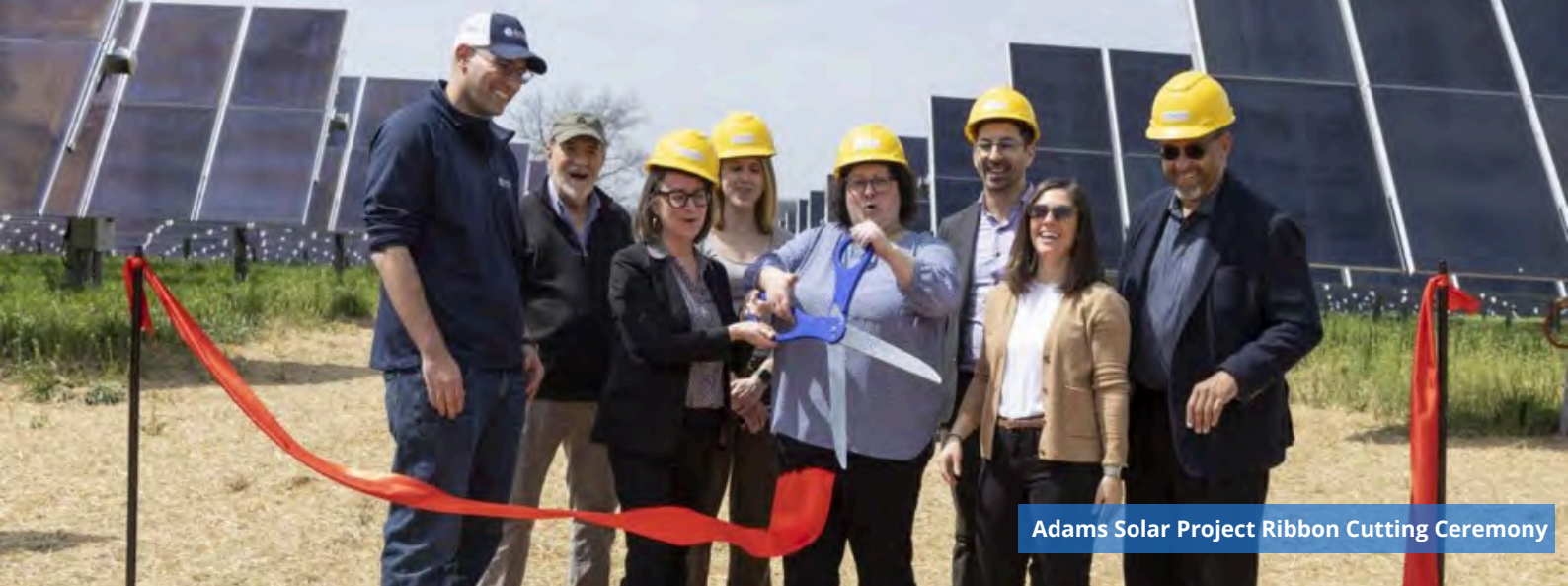
Adams Solar Project Ribbon Cutting Ceremony