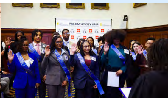
High school students are sworn in during PAL Day at City Hall on March 20. The annual event, hosted by the Police Athletic League, gave 15 Juniors and seniors the chance to step into city government roles and shadow City officials.