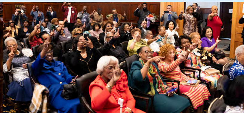
Attendees at the Women's History Month Event on March 27 raise their hands for One Philly during the gathering at City Hall.