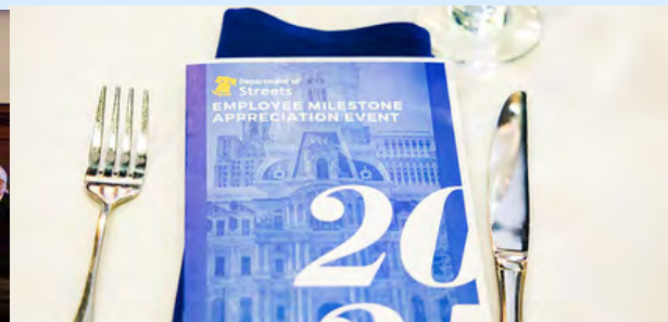
A program booklet for the City of Philadelphia Streets Department Employee Milestone Appreciation Event held on March 27.