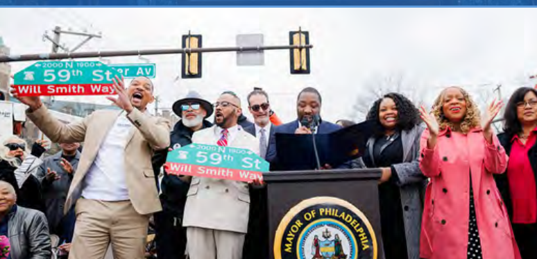
At the Will Smith Street Naming Ceremony on March 26 the actor and City Council celebrate the renaming of 59th Street to "Will Smith Way"