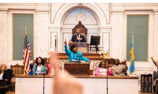
Mayor Cherelle Parker delivers her "One Philly 2.0" Fiscal Year 2026 Budget Address to City Council on March 13, outlining priorities for a safer, cleaner, greener Philadelphia with access to economic opportunity for all.