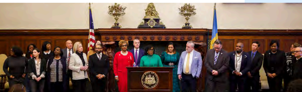
On March 21 Mayor Cherelle L. Parker announced seven appointments to fill key roles in various departments and agencies, including the Office of LGBTQ+ Affairs, the Procurement Department, Public Property, Department of Planning and Development, and the new Office of Business Impact and Economic Advancement