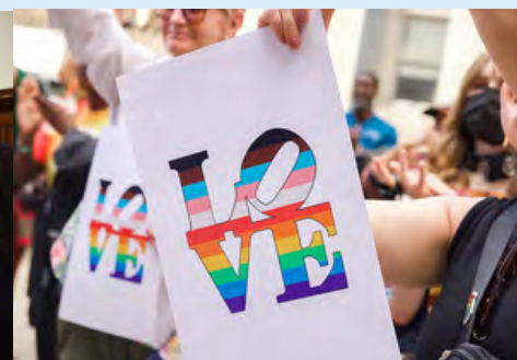
Community member holding signs that say "LOVE" in rainbow colors at the Trans Day of Visibility Flag-Raising on March 31.