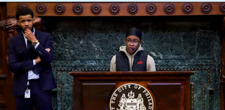
A Student speaks at the Mayor's Office of Black Male Engagement's Brotherhood Empowerment Series event held on April 1.

The Serve Philadelphia VISTA program is hosting open houses to share information about the program, the application process, and available VISTA positions for the 2025-2026 service term. Join us to meet current VISTA members and staff and to learn more about this incredible opportunity to develop your career while supporting Philadelphians. Learn more and spread the word!